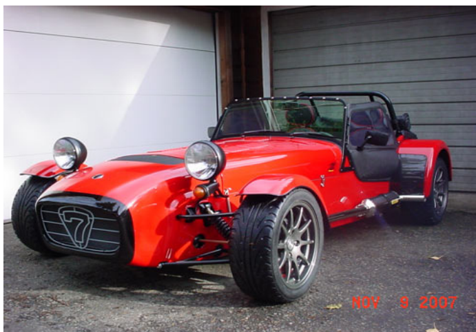
The 2008 R-Type from Super7 Cars Inc. 0-100 KM 2.96 Seconds

Article by: David Saville Peck SUPER 7 CARS INC.